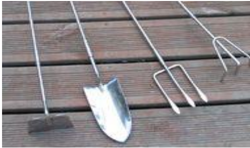
T-handle long reach trowel and fork